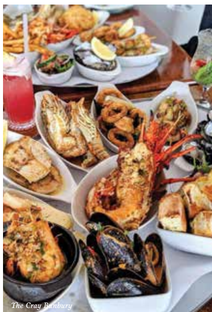
The Cray Bunbury