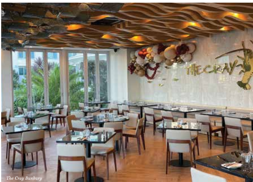
The Cray Bunbury

cooler months. there's no better place to turn off your phones and enjoy the freedom of being out in nature.