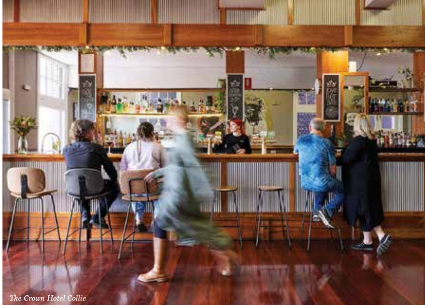
The Crown Hotel Collie